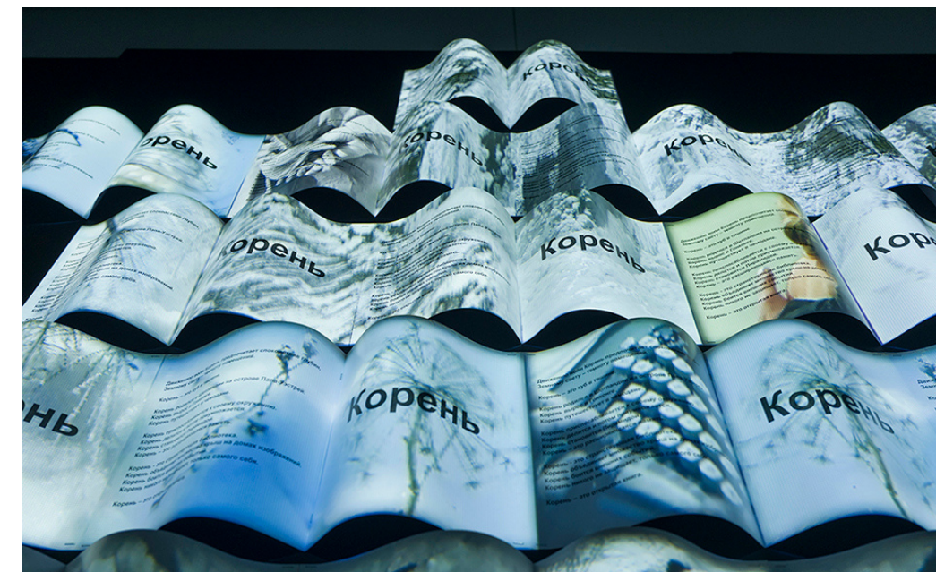
Souche 2.0 , Anne-Sophie Emard, Theater workshop, Pskov (Russia) | VIDEOFORMES

Artist's network: https://www.instagram.com/annesophie.emard/