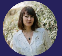
Mariko Kieffer Photography & video