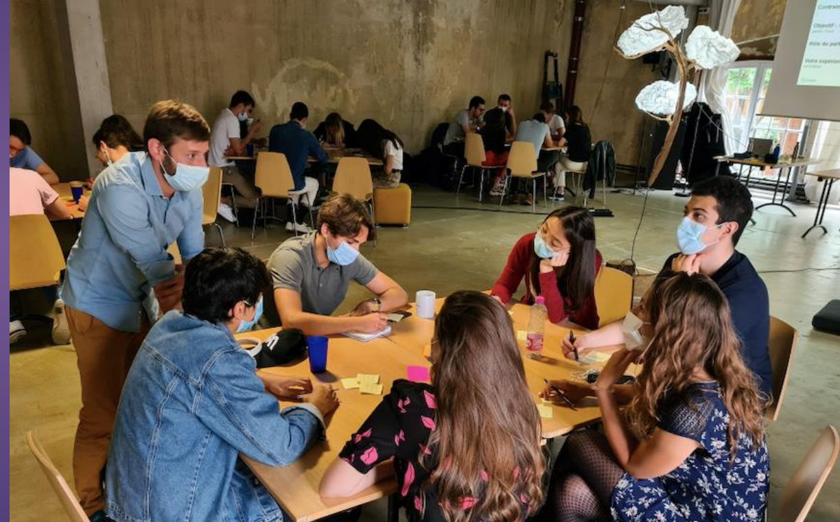
Immersion Workshops with students from Centrale Supélec – Juillet 2021 (Paris)