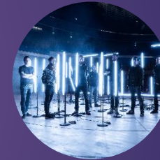
Collectif Scale Art collective