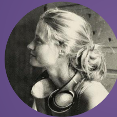
Elodie Fiat Sound Effects