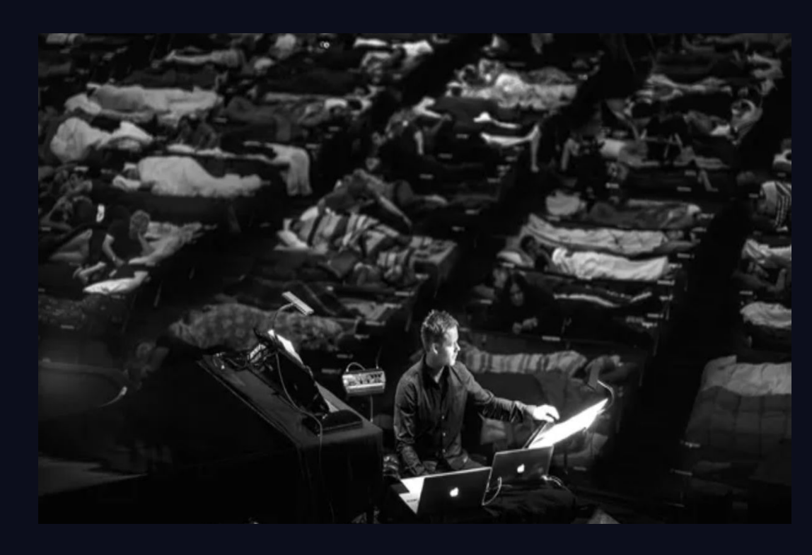
Lying concert of Max Richter at Philarmonie de Paris

The audience lies on the floor or on deckchairs and watches the projection on the ceiling. The performers are seated in the center and play live while the audience watches the visuals.