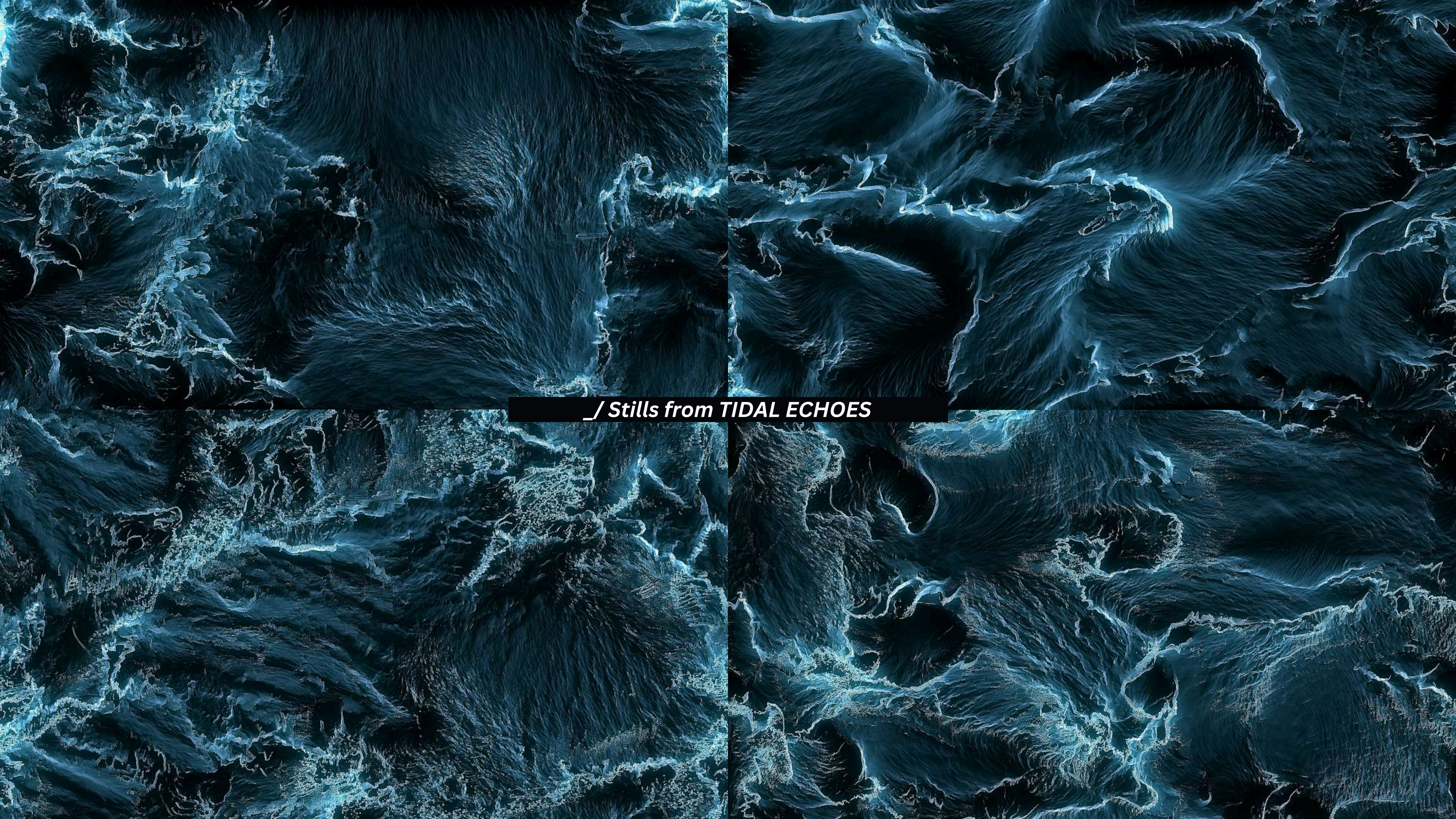
/ Stills from TIDAL ECHOES