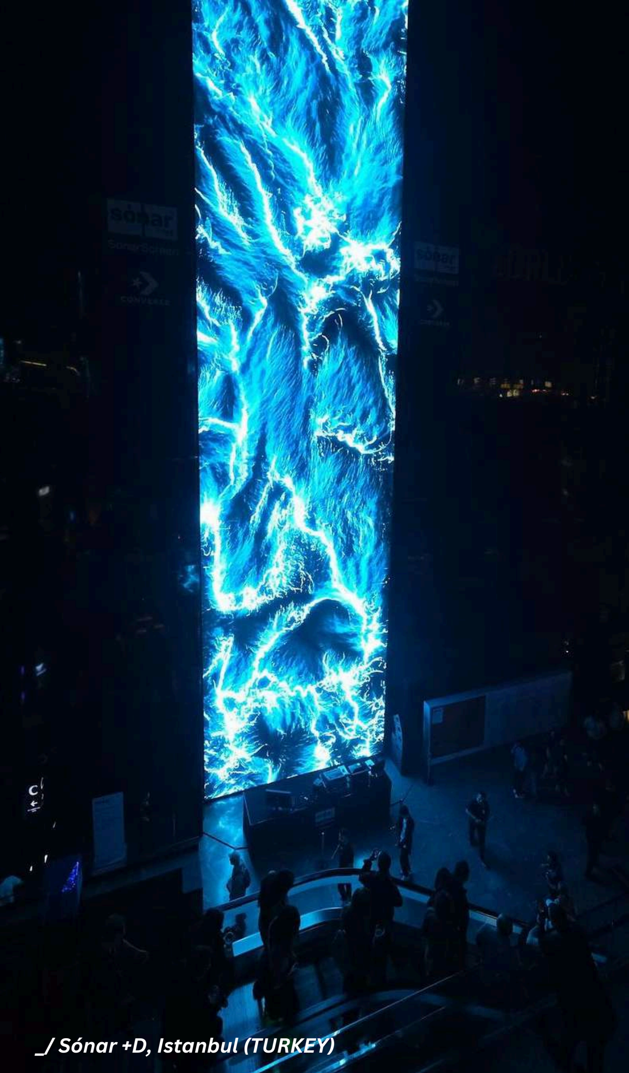
_ / Sónar +D, Istanbul (TURKEY)