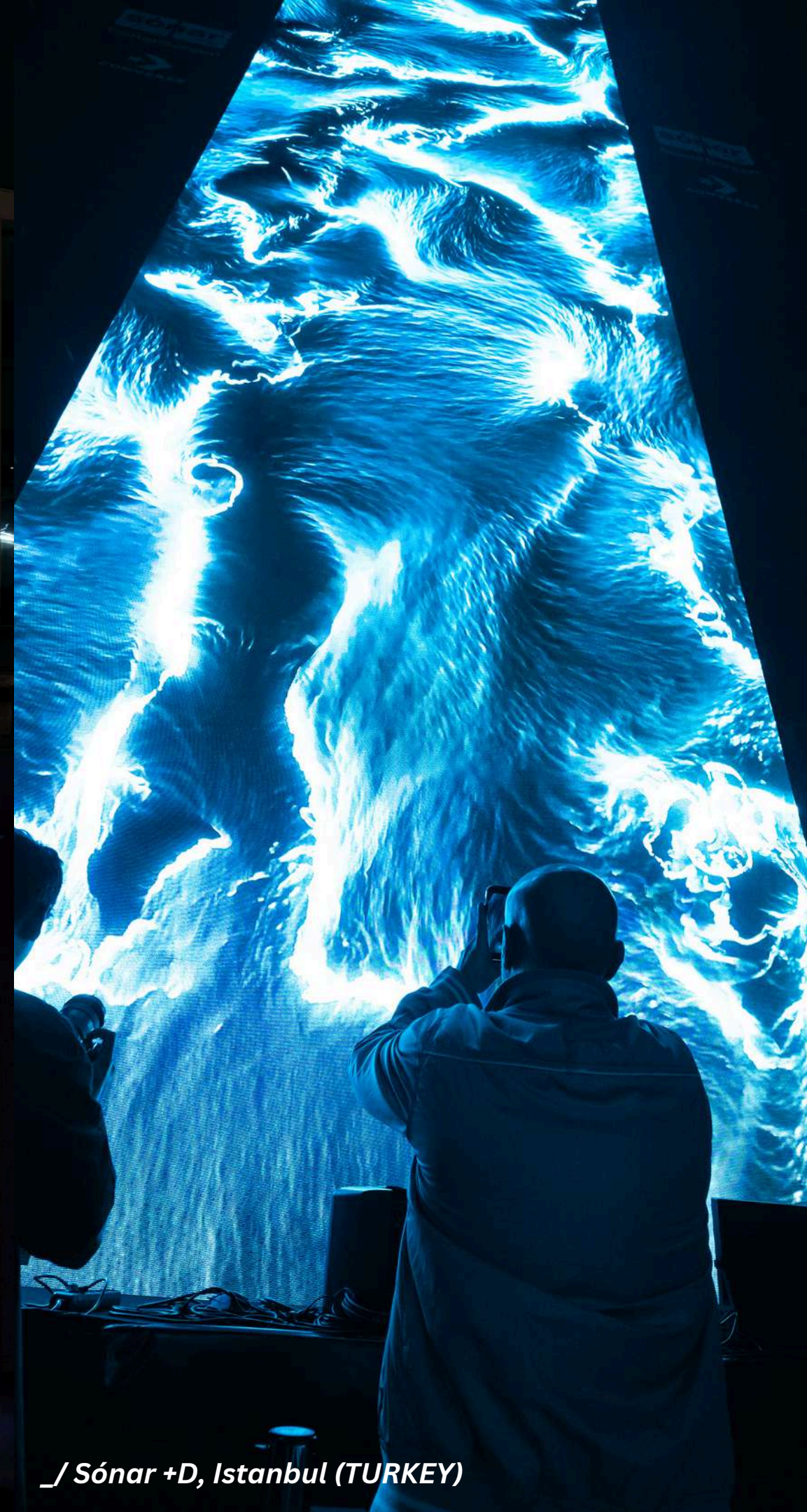
_ / Sónar +D, Istanbul (TURKEY)