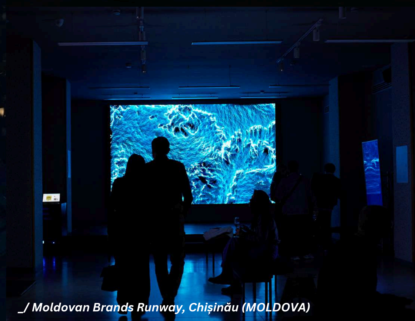
_ / Moldovan Brands Runway, Chişinău (MOLDOVA)