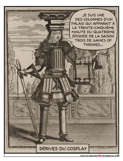
Figure 5: "Dérives du cosplay", by Un Faux Graphiste, created using the BDnF application developed by the French National Library. © Un Faux Graphiste.

Figures 3 and 4: Pages 1 and 2 of "Battling Siki contre Georges Carpentier", a 16-page comic by Raphaël Meyssan created using the BDnF application developed by the French National Library, reusing resources available via Gallica, the digital library of the French National Library. © Raphaël Meyssan.