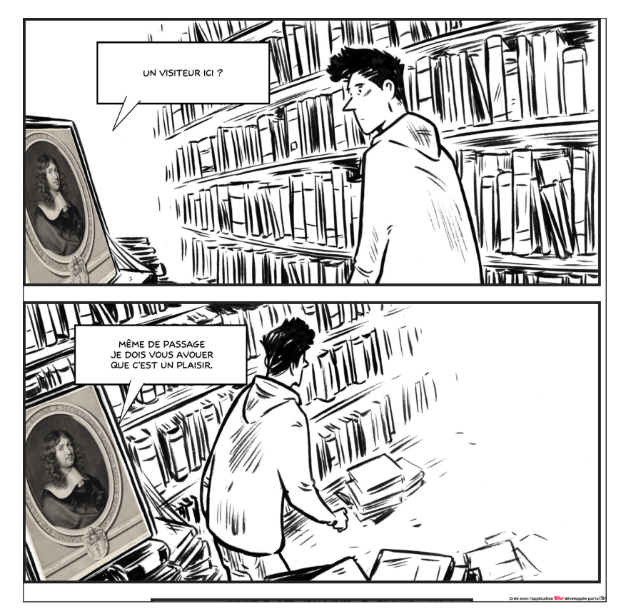
Figure 6: Two panels from an untitled 25-panel comic by Adrien Martin (2020) created using the BDnF application developed by the French National Library. © Adrien Martin.

This also allows us to clarify two important points: on the one hand that there is no need to know how to draw to use BDnF, on the other hand, that being an illustrator is a profession that implies a know-how. An application can make it possible to initiate the public into the art of comics but it will never replace the work of artists, budding or confirmed!