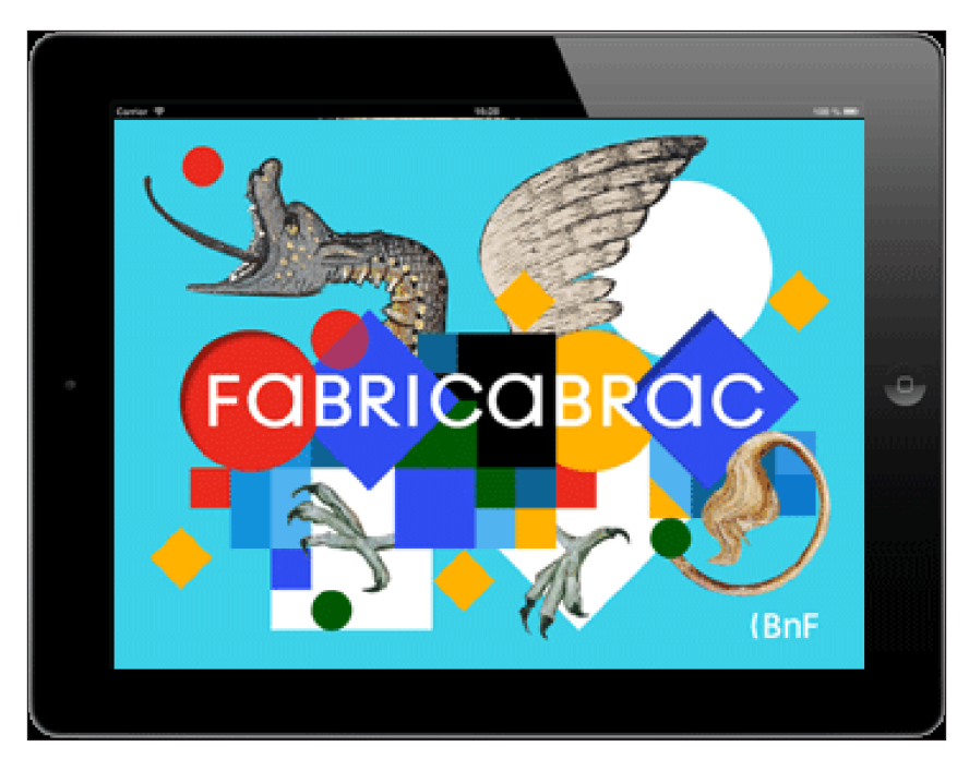
Figure 2: Promotional image for the Fabricabrac app (BnF 2017).

What could be better for the BnF, which will welcome in its future museum – at Richelieu's site – the largest collection of comics in Europe, around 8000 titles, than to offer young audiences a tool for creating stories in images, in comics? Beyond the creative tool we wanted to provide the keys for understanding the art of comics: how to design a panel? How to structure a visual narration on a book and on a digital