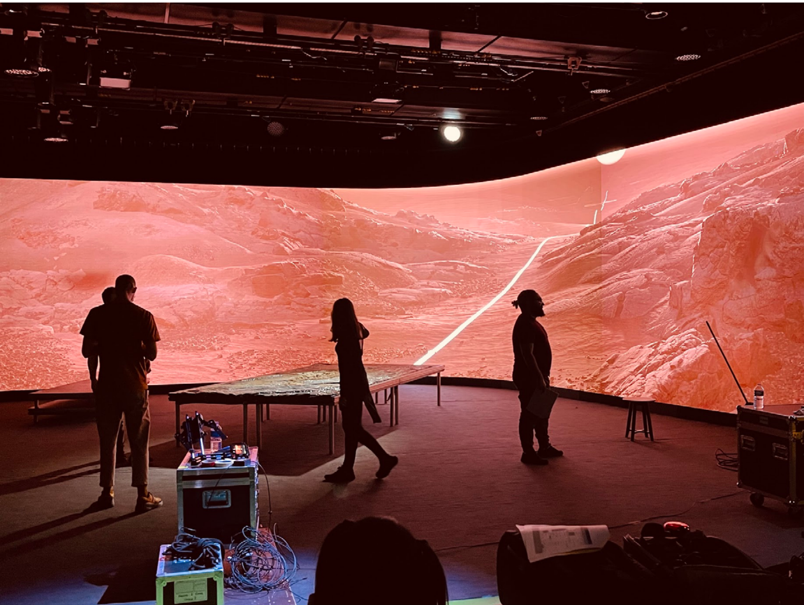
Shooting of Rintsug/i in virtual production, Unreal scenes in real-time modeled by ARTFX with operated tracked camera by BigSun Shot at MVizion studio, Palais des Congrès – Produced by ARTFX with the support of Bizzaroid, BigSun, MVizion and Centre des Arts d'Enghien-Les-Bains