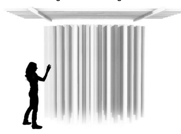
Small version : lenght = 1m50