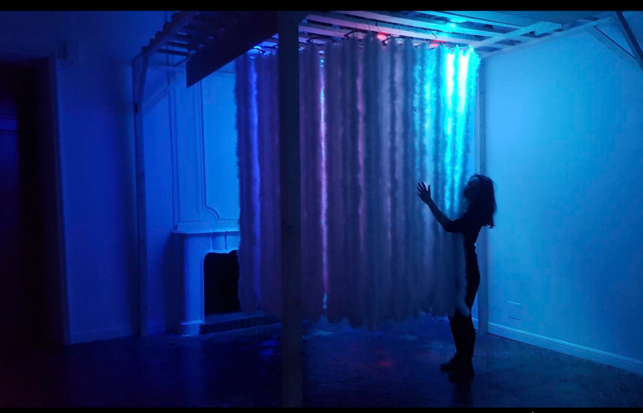
Musée de Vence / Fondation Émile Hugues - Vence (Fr)